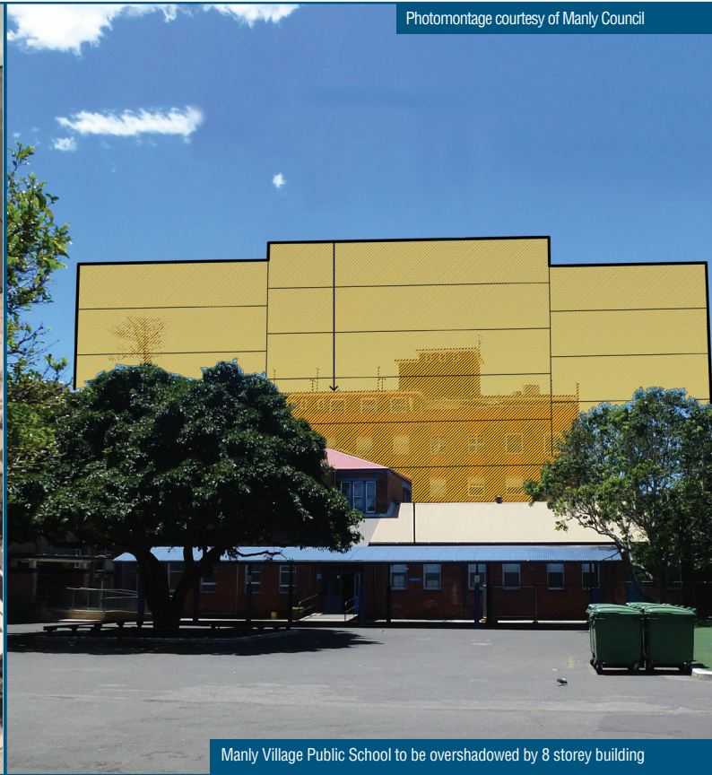
Photomontage courtesy of Manly Council