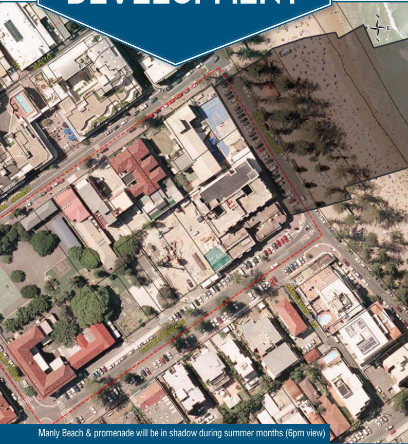
Manly Beach & promenade will be in shadow during summer months (6pm view)

The development is too bulky, too high and totally inappropriate for this important and historic site in our Manly Village.